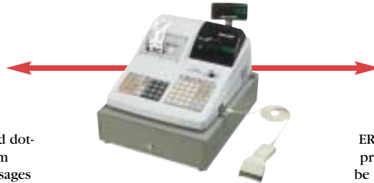
ER-A450S 2-STATION THERMAL PRINTER

ER-A440S has an advanced high-speed dot-matrix printing system - sales item descriptions, cashier names and messages can be printed on your personalised customer receipts. Can also be used to print details on validation slips