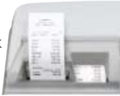
ER-A440S 2-STATION DOT MATRIX PRINTER

ER-A440S has an advanced high-speed dot-matrix printing system - sales item descriptions, cashier names and messages can be printed on your personalised customer receipts. Can also be used to print details on validation slips